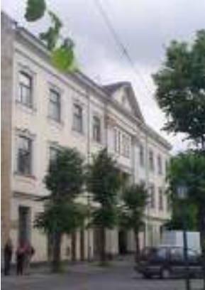
Mazovia Region Centre of Culture and Arts