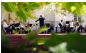
Association of Cultural Centers of Estonia

Direct link to the database: http://database.encc.eu/languages.php?